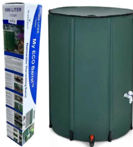
Collapsible 132 gallon rain barrel. Photo: My ECO Barrel™