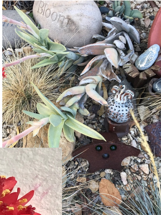
Crassula falcata - it is fragrant!!!