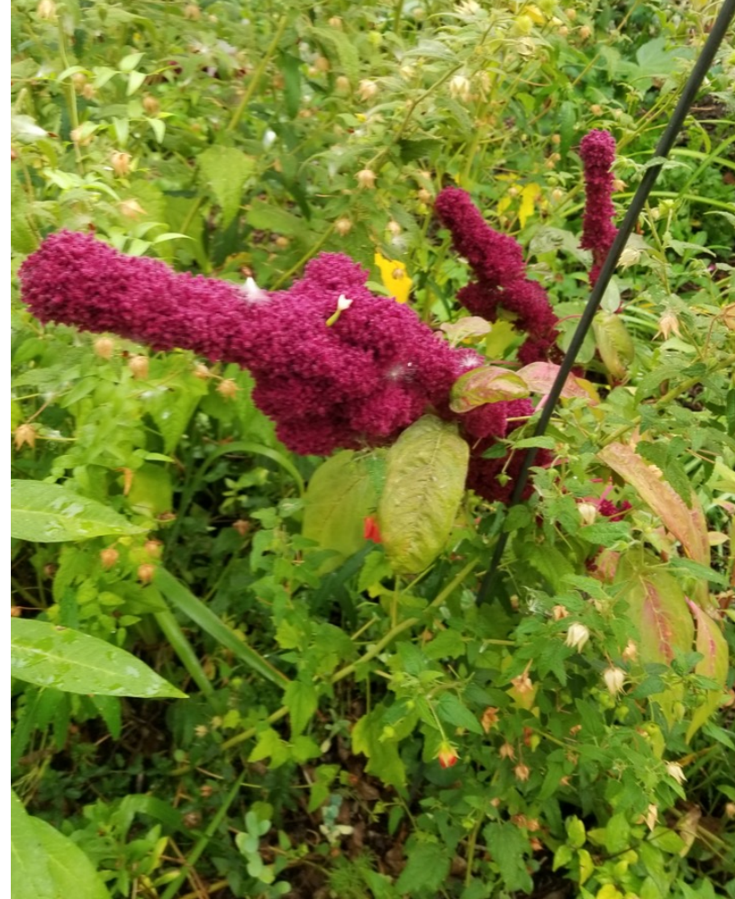
The red Elephant amaranth gangeticus is a German hybrid annual. Its leaves are edible as well as its seeds.