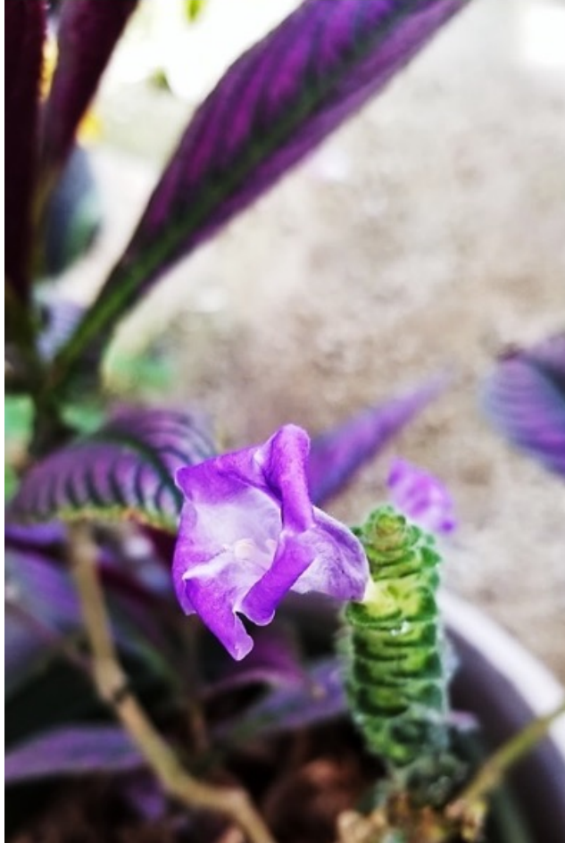
Persian Shield Strobilanthes dyerianus

My Persian Shield has been relocated from the Walnut Creek area in Calif to Southern Oregon 3 yrs ago and kept in the unheated greenhouse for the past 3 yrs. Thought I had lost it when we had a huge snow storm a year ago, but it came back and to my surprise put out a bloom this summer. First time it has bloomed for me since I've grown it for the last 5 yrs. The greenhouse is cooled in late summer Aug as that is our warmest month, but not heated in winter. I was elated to see the bloom.