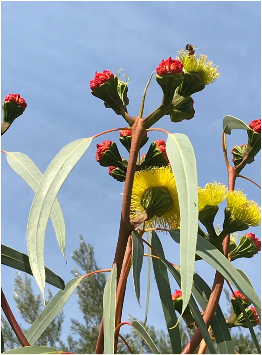
Eucalyptus erythrocorys from 4" plant from Annie's about 6 years ago.....A bee magnet.