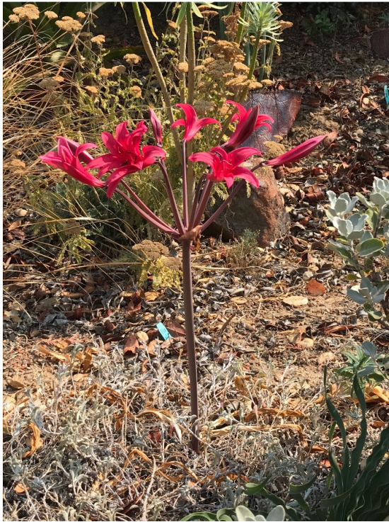
Brunsvigia littoralis South East cape in coastal sands