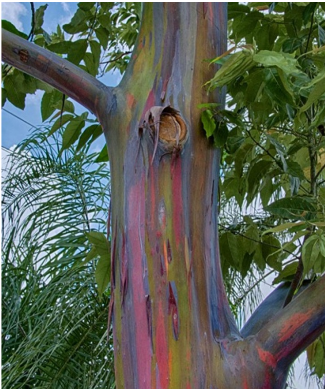
Rainbow Gum Eucalyptus deglupta

Above is what Mark's youngin' aspires to be.....to the right it is where it is now... but getting there.