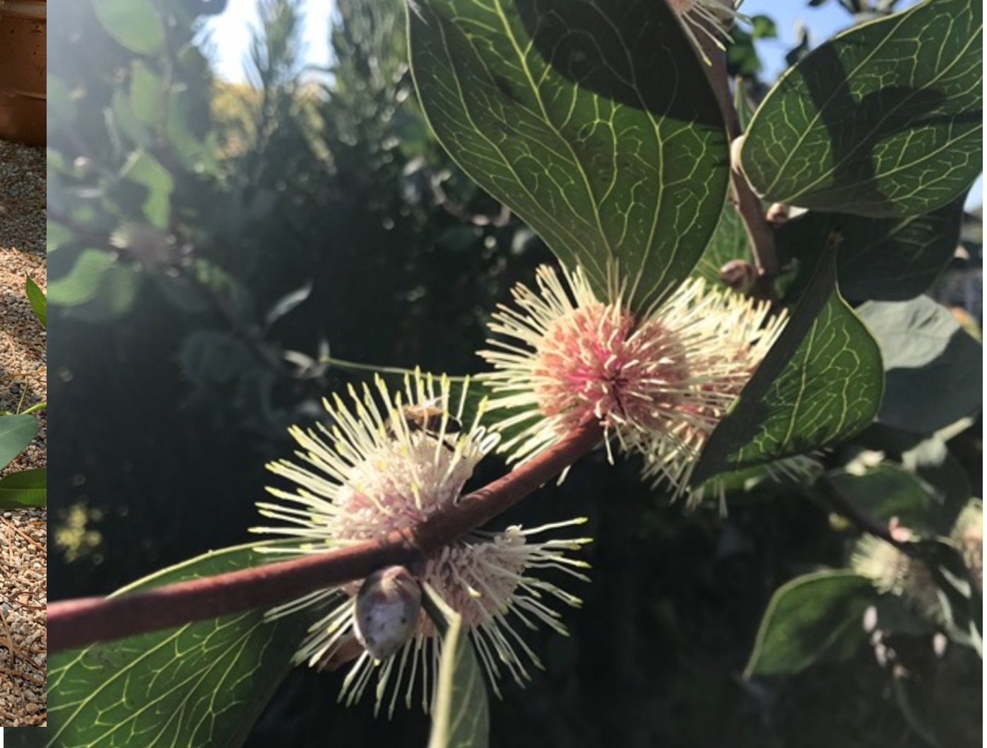
Hakea laurina (sample of what it will look like. Troy McGregor's photo)