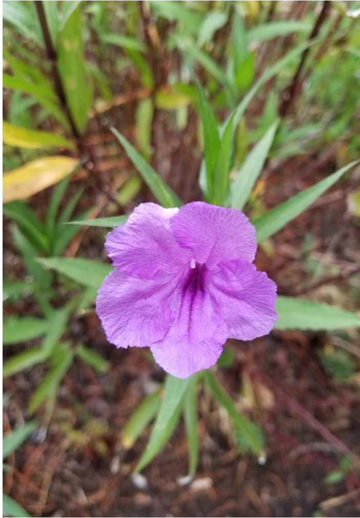
Ruellia brittoniana is often called Mexican petunia. It is tropical, but like many in the acanthaceae it is root hardy in our zone 9. It flowers all summer, and gently seeds about, but also can run, It is both tolerant of water and a drier situation.