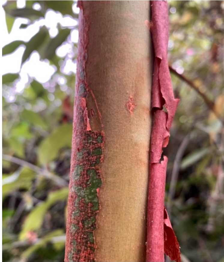
Rainbow gum...peeking over the other plants...