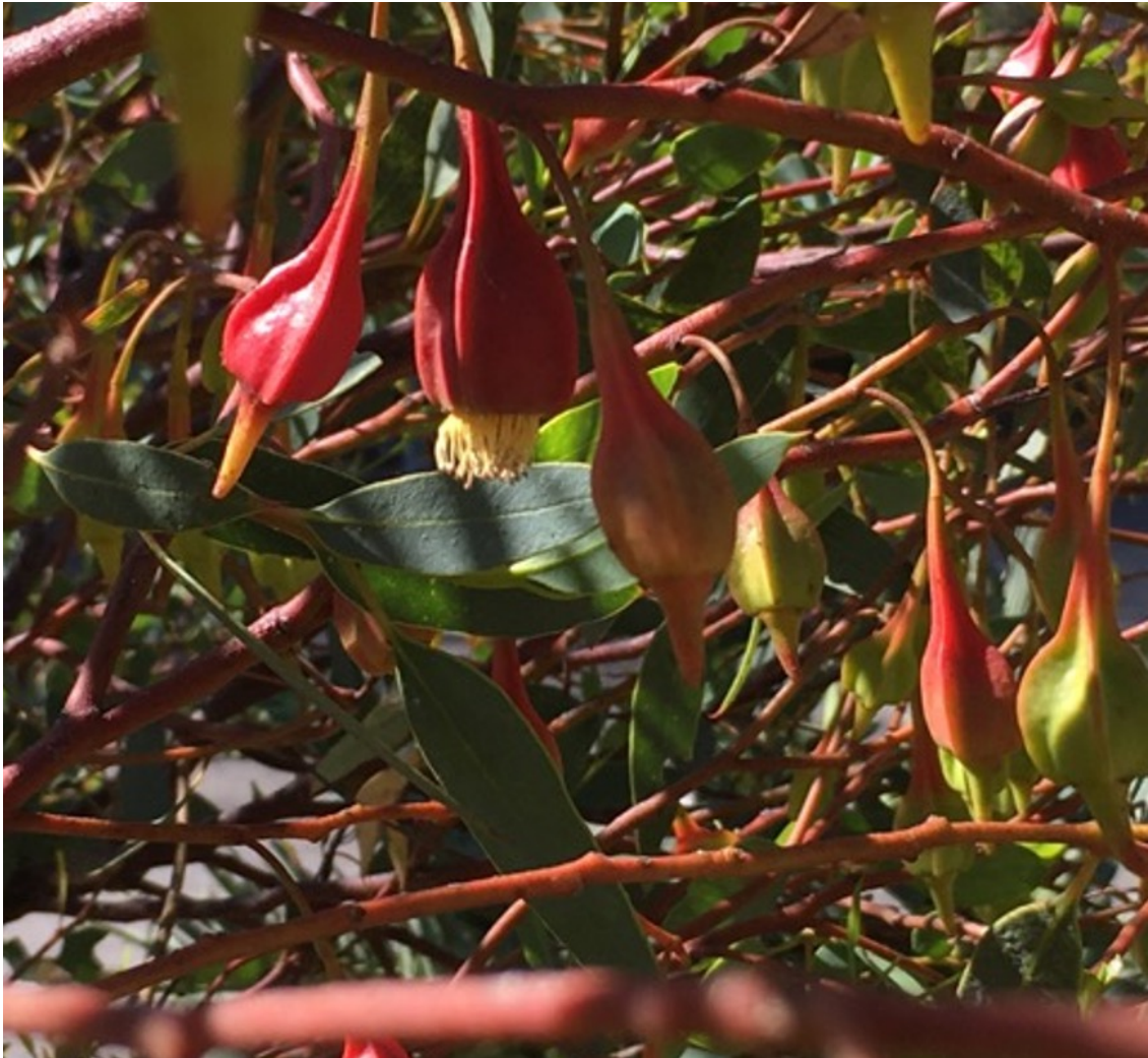
Fuchsia Gum Eucalyptus forrestiana