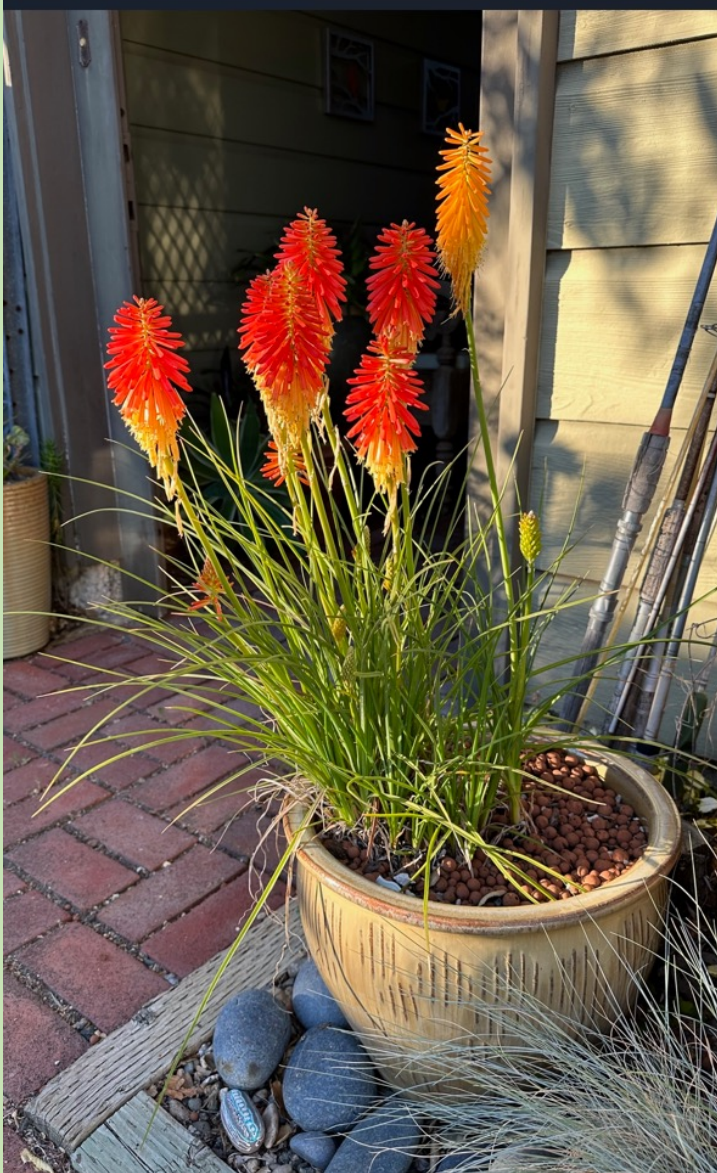
Kniphofia 'Mango Popsicle'

The Popsicle series was introduced by Terra Nova Nurseries, Inc.