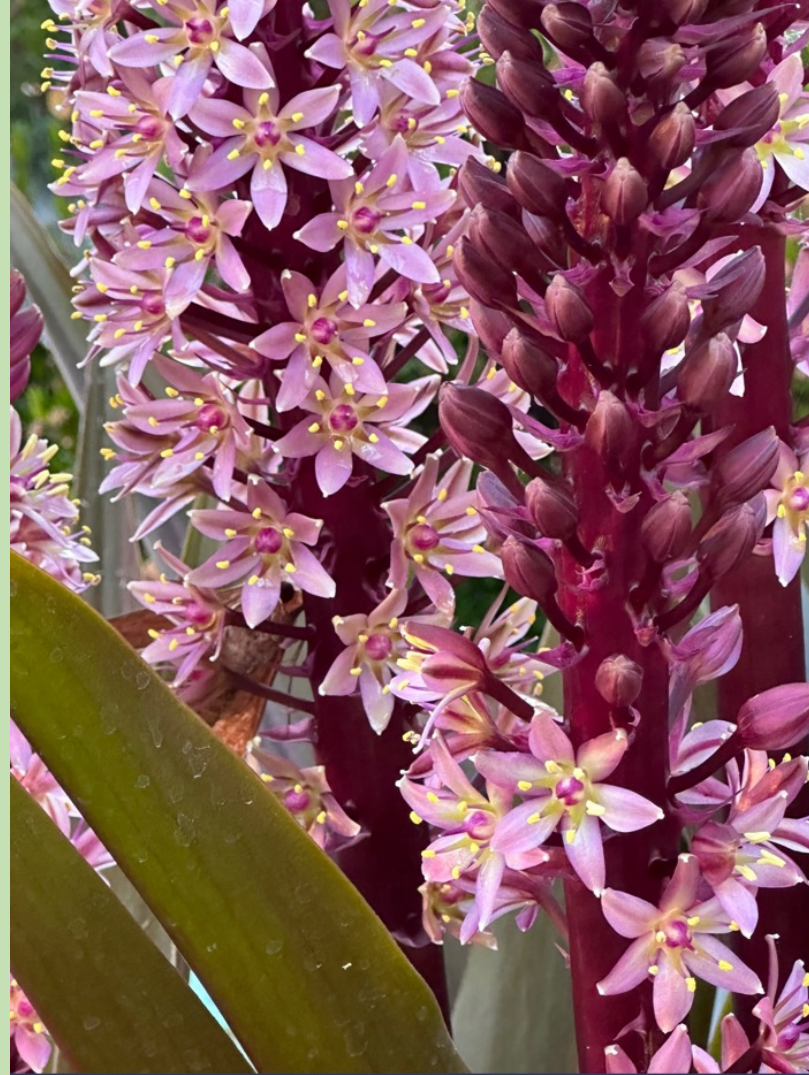
Eucomis "Oakhurst", Pineapple Lily

I enjoy this plant every year. It is completely deciduous and comes up with the darkest maroon foliage, then these pineapple topped flower spikes bloom with pink flowers. There are a lot of Eucomis cultivars that are different sizes and leaf colors. It is in the Asparigaceae