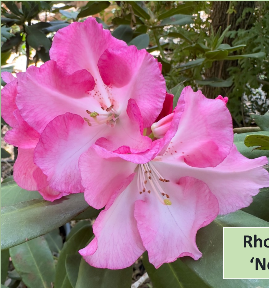
Rhododendron 'Noyo Dream'

"I have unsuccessfully tried to grow Rhododendrons in my local heavy clay, but this Rhododendron is in a 15-gallon pot in a soil mix of wood chips, compost and pumice and is sheltered under mature native Oaks."