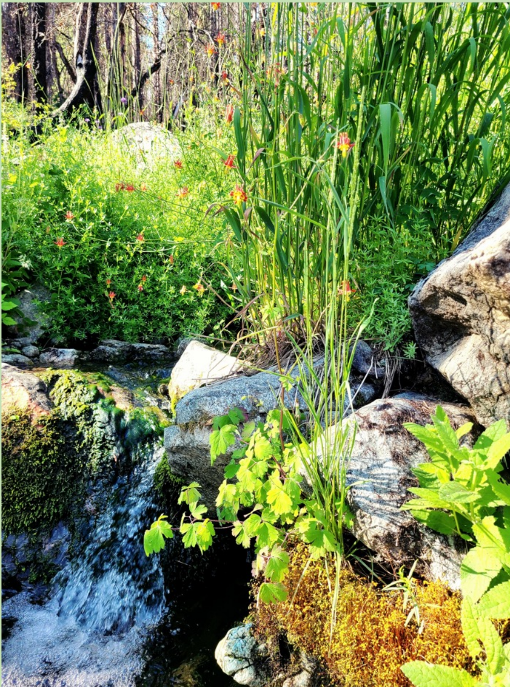
Lilies and Columbine