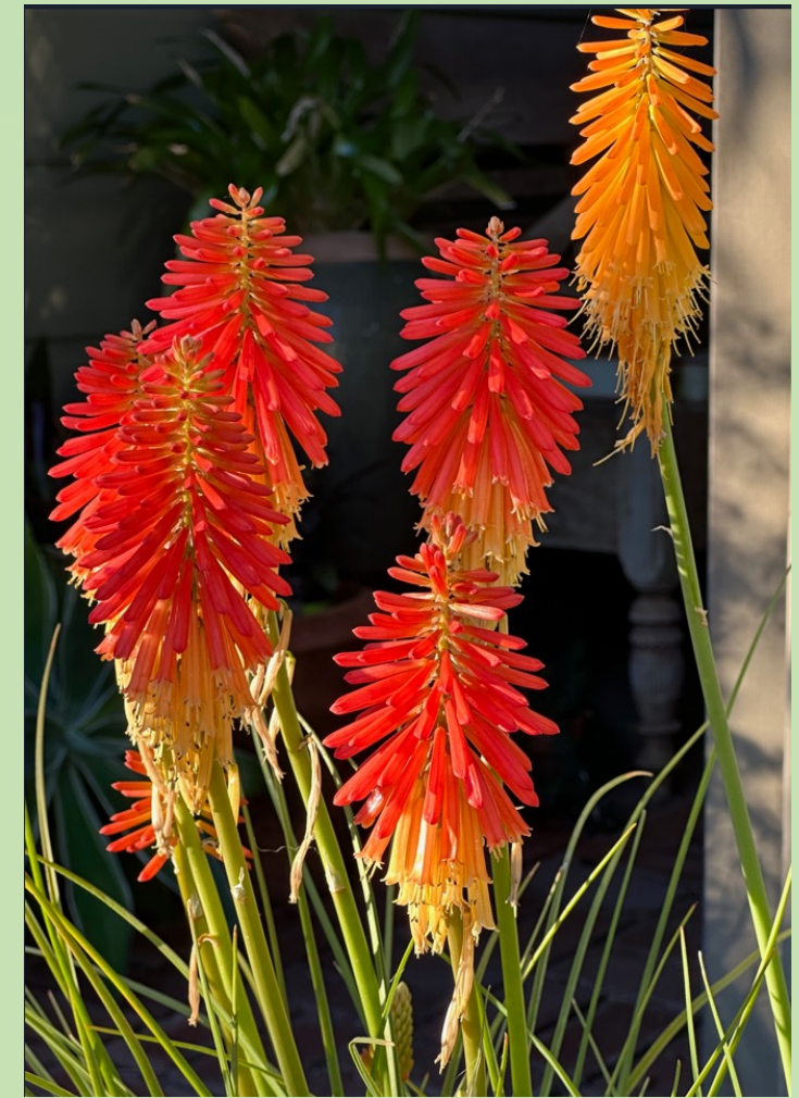
Kniphofia 'Papaya Popsicle' and K. 'Mango Popsicle'

Evidently, they need moisture when the blooms are forming and will fail to flower if conditions are too dry. They benefit from deadheading to encourage rebloom.